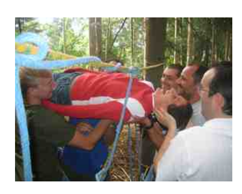
For more information: www.inn-ovation.at